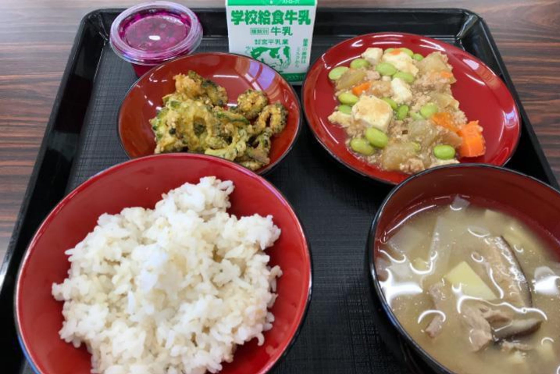
By Tokashiki Village